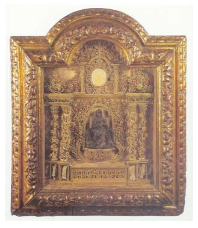
Religious picture, probably Italian, c. 1700, 26" x 22." It features strong architectural elements with the central Madonna and Child beneath a coat of arms. The small niches under the columns most likely hold reliquaries.