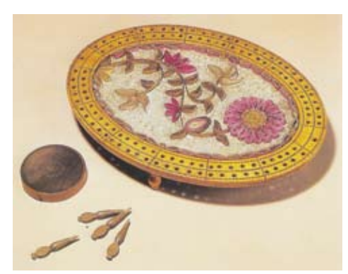
Cribbage board with a lovely floral spray surrounded by crushed white glass.