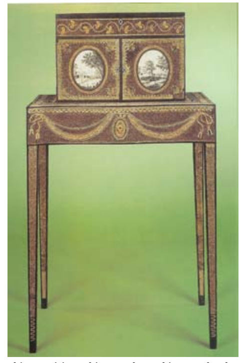
This exquisite cabinet and stand is completely covered in paper filigree, with the exception of two oval silk panels on the doors which are painted with rural scenes. It is dated 1787, and stands 41" tall.