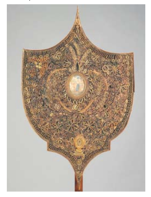
This pole screen was probably made by a prisoner of war. Note the cruder work, and the way the background is completely filled in by loosely rolled papers. Also note the extensive use of accordion-folded, or crimped, paper.